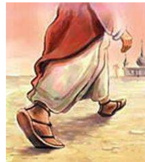
Adoration and Prayer